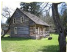
The Pike House...

http://www.highlands.bc.ca/183/Emergency-Preparedness