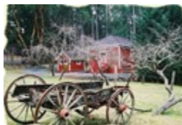
Highland Heritage School House...

The Pike House and the Highland Heritage School House are available for rental for birthday parties, weddings, or other private celebrations.