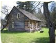
The Pike House...

http://www.highlands.bc.ca/183/Emergency-Preparedness