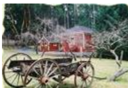
Highland Heritage School House...